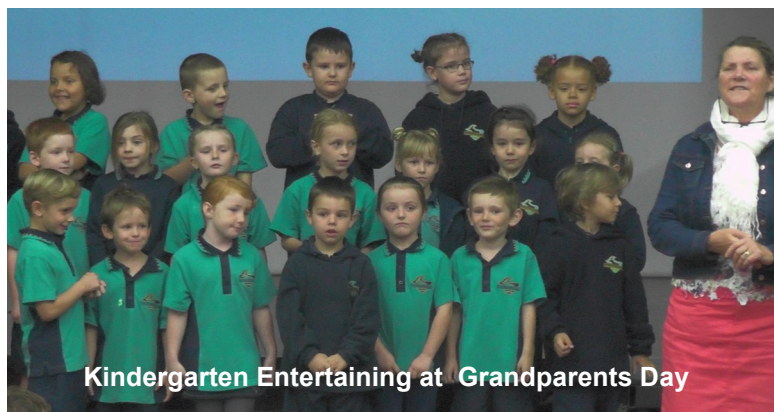
Kindergarten Entertaining at Grandparents Day