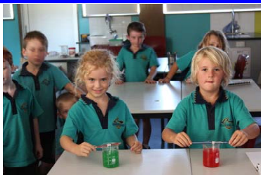
Kindergarten grow crystals