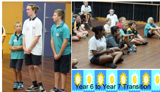
Year 6 to Year 7 Transition

This will be the final Active After School Activities afternoon for 2014